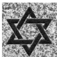
1 Magen David

Please circle the number which corresponds with the religious symbol of your choice. The symbol will be positioned at the top of the monument template (see below)